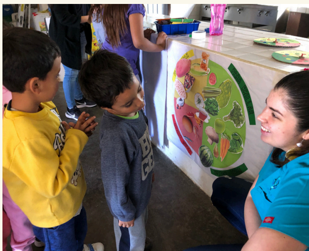
Children choose foods for a balanced meal

Did you know that your food preferences are formed in the very first years of life? Mexican children typically do not eat many vegetables. Many local children couldn't identify common vegetables such as eggplant or beets when shown pictures in a food game. BCS has the 3rd highest rate of overweight and obesity of children in Mexico. We use health fairs, games, videos, publications and workshops to promote healthy diet choices to a very young audience showcasing locally available foods.