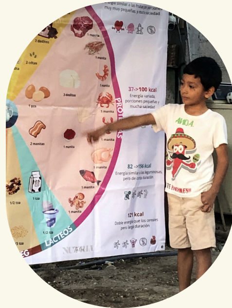
A child identifies local foods on the “my plate for my futur” game

This is a UNESCO network of municipalities from around the world that committed to creating a model for cooperation drawing from environmental, health, and artistic local culture to enhance lifelong educational experiences particularly for the economically disadvantaged.